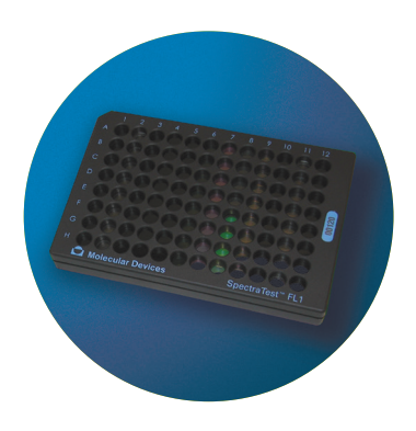
Streamline GLP/GMP compliance. The SpectraTest FL1 Validation Test Plate provides a complete solution for validating optical performance of the Gemini XPS reader.